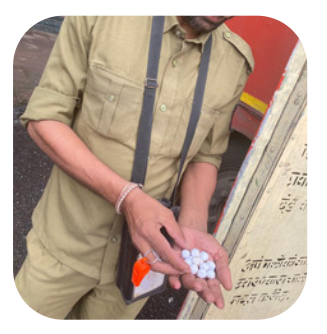
DISTRIBUTION OF 2400 SEEDS BALLS TO TRAVELLERS