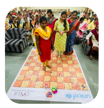
110 TEACHERS AND SUPERINTENDENTS OF 67 DAHANU ASHRAMSHALAS TRAINED

'From Taboo to Empowerment: "I believe Menstrual Hygiene and Health is one of the crucial weapons to fight gender inequalities and stigma around menstruating women. Since I have been associated with CACR I have interacted with thousands of adolescent girls and women from urban and rural areas and educated them on the importance of menstruation health and hygiene."