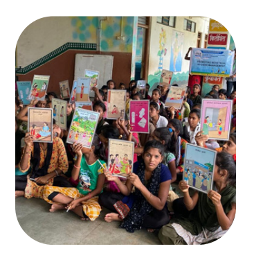
3200 ADOLECENT GIRLS FROM 16 ASHRAMSHALAS , PALGHAR