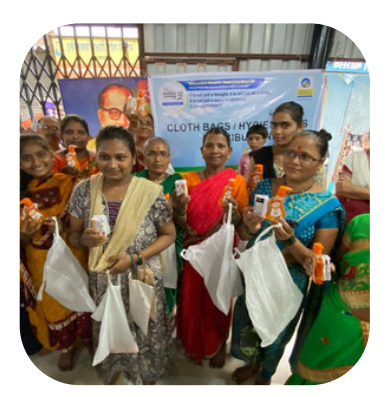
15000 HYGIENE BAGS WERE DISTRIBUTED TO DOMESTIC MAIDS, POLICE OFFICIALS, AND ANGANWADI SEVIKAS IN MUMBAI