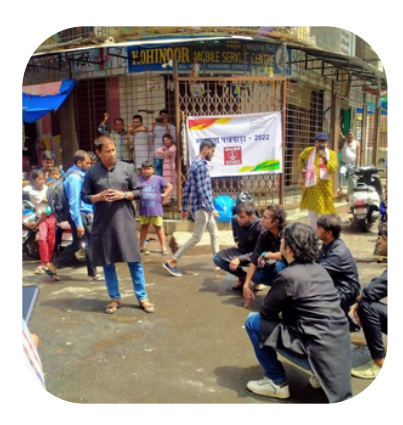
NUKKAD NATAK IN 10 LOCATIONS ACROSS MUMBAI SUPPORTED BY BPCL AND ONGC