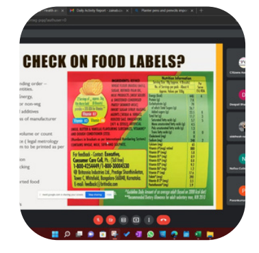
WEBINAR ON NUTRITION AND FOOD LABELS