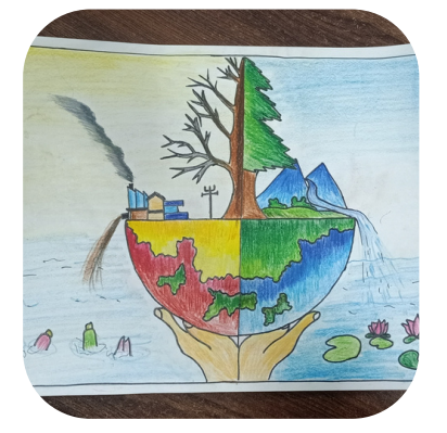
POSTER COMPETION BY CHILDREN ON SWACCH BHARAT