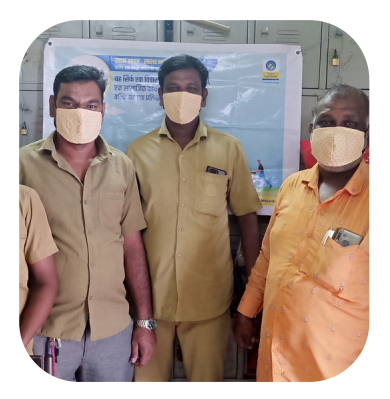
11700 CLOTH MASKS DISTRIBUTED TO SAFAI KARAMCHARIS OF SWM DEPARTMENT, MUMBAI

'The planning and execution of the program were very well thought out and in coordination with the education department. The kit is very inclusive and will promote good hygiene practices among children. The awareness session will act as a catalyst in the formation of lifelong hygiene habits in children along with covid-19 behavior.