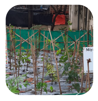
MIYWAKI PLANTATION 500 SQ. MT SHAHJINAGAR MCGM SCHOOL