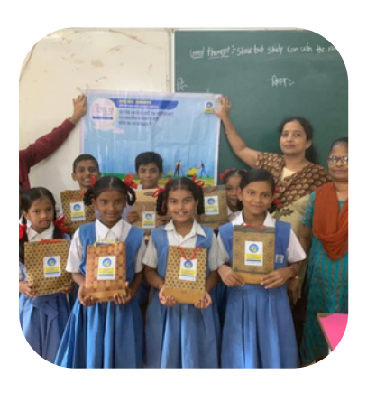
WINNERS OF POSTER COMPETION GETTING PRIZES

'Conducting health camps for Safai Karam charis is one of the important ye neglected areas. We really appreciate this initiative by CACR and BPCL Mumbai Refinery to not only arrange this but taking extra efforts to reach out to maximum beneficiaries and providing hard copies.