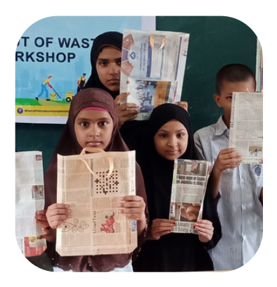
WASTE UPCYCLING WORKSHOPS WITH 1500 SCHOOL CHILDREN IN MUMBAI AND THANE