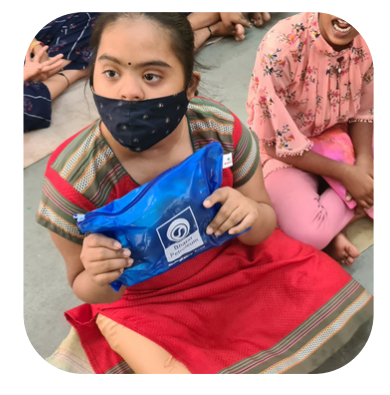
AWARENESS SESSIONS & HYGIENE KITS DISTRIBUTION FOR 27378 CHILDREN FROM 119 THANE MUNICIPAL SCHOOLS WITH SUPPORT FROM BPCL