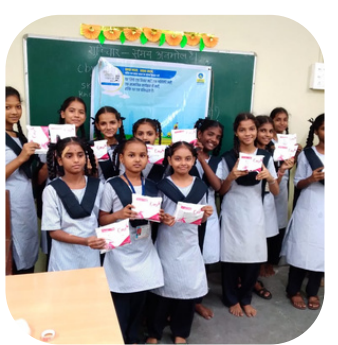
5000 ADOLECENT GIRLS FROM GOVERNMENT RUN SCHOOLS , THANE & MUMBAI