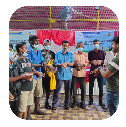
MASS AWARENESS SESSIONS ON HAND WASHING STEPS 8000+ POPULATION IN THANE AND MUMBAI