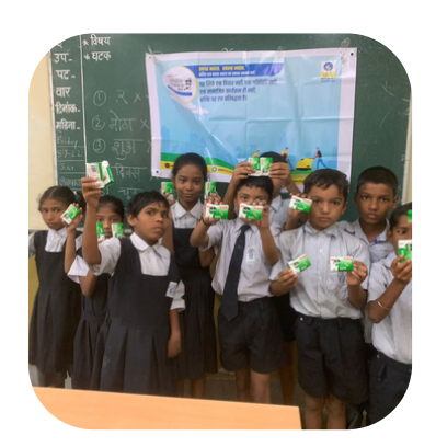
35000 SOAP DISTRIBUTED TO PROMOTE HAND WASHING WITH SOAP WITH SLUM DWELLERS AND CHILDREN IN MUMBAI AND THANE