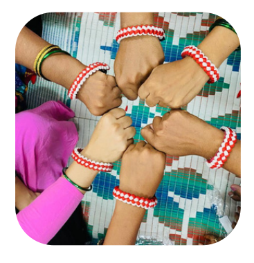
CELEBRATING MENSTRUAL HYGIENE AWARENESS WEEK / 28TH MAY